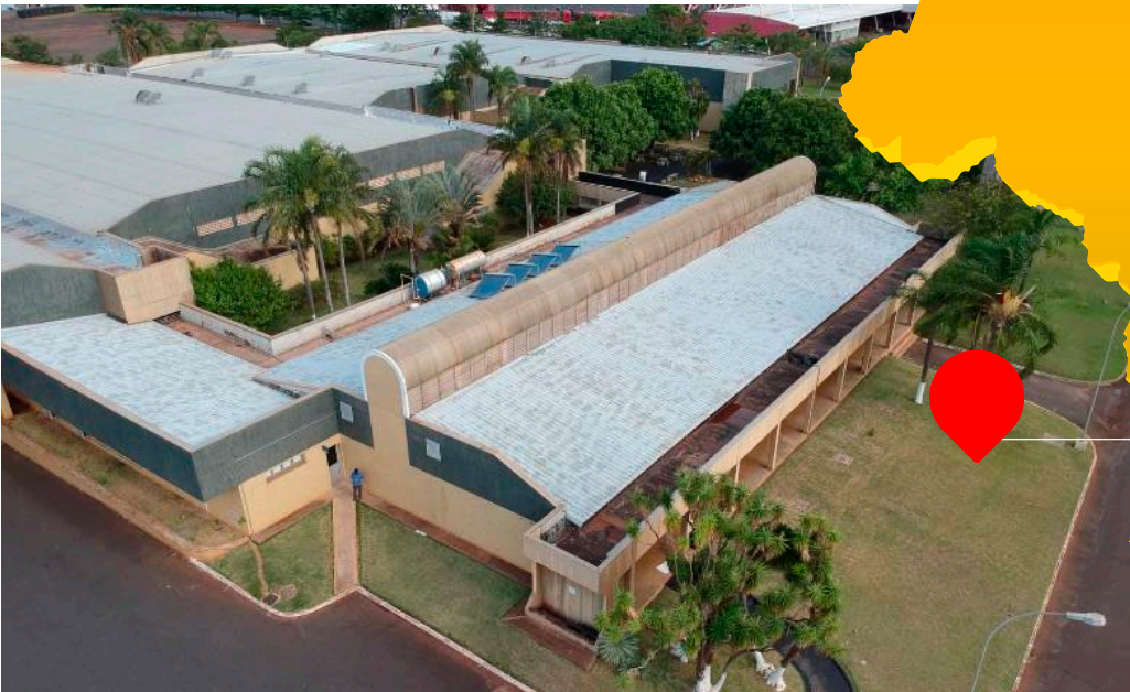
▲ Aerial view of Novo Mundo Hatchery from Planalto Postura.

Minas Gerais, a state in Brazil rich in gold and other gems, has a history rooted in its name, which means “General Mines.” This region, once a major source of gold and silver during Brazil’s colonial era, is now home to another treasure: the Novo Mundo Hatchery, operated by Planalto Postura, which has just celebrated its 30 th anniversary.