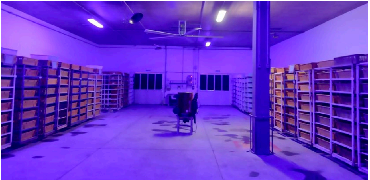
▲ Chick holding room with capacity for up to 250,000 DOC at a time ensures perfect climate conditions to guarantee the best welfare status.