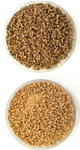
Figure 1. Appearance of ► the finished pelleted diets. Top: Hermetia meal diet , below: Soybean meal diet

The two studies mainly differ in the experimental diets. Varying replacement levels of SBM with HIM, and differing supplementation level of crystalline AA. The control diets were based on wheat, corn and SBM as the main ingredients.