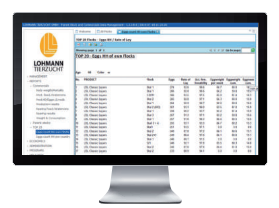
Peer Report of own Flocks