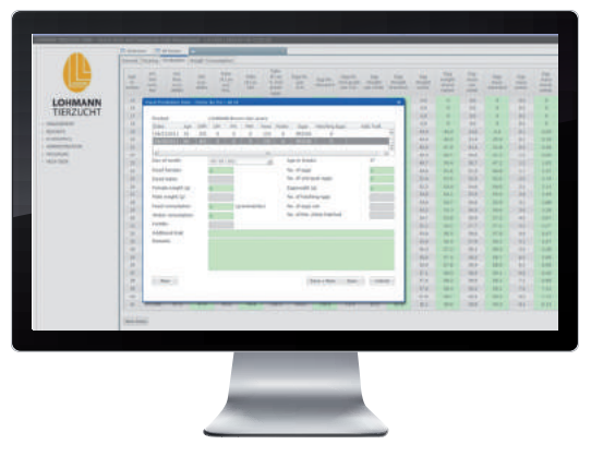
Input of Data

web-based, easy accessible data managing and monitoring tool for parent stock and commercial flocks to find under http://ltz.flockman4u.com