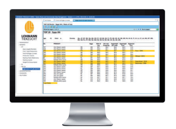
Peer Report of whole Database