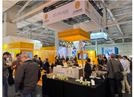
WORLDWIDE | EuroTier 2024: Successful world's leading trade fair provides business-relevant impetus